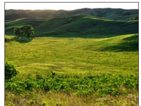
Broken Kettle is in the Loess Hills region of western Iowa.