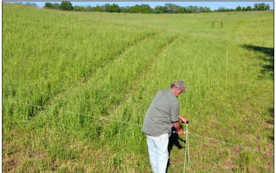
Specht moves his cattle to a new paddock every three days. With ten paddocks, they make the circuit in a month.

rotates pastures, the calves can go on a pasture early in the spring, as soon as the grass starts growing. "Figuring out a grazing system each year is about as much art as it is science," Specht says. "It's a little different every year."