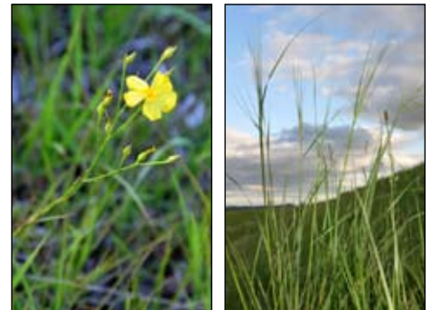
Yellow flax (left, above) and porcupine grass (right, above) are two of the more than 200 species of plants now found on the Broken Kettle Grasslands. Moats is grazing both bison and cattle to maintain and increase the diversity of plants on the prairie.

Moats says the prairie is diverse and complex, and changes every day. He says it's particularly beautiful in the fall when the native grasses cure out. "Late September and October are the best times here," he says. "It's gorgeous."