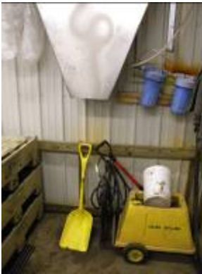
Ice machine chute at Featherstone