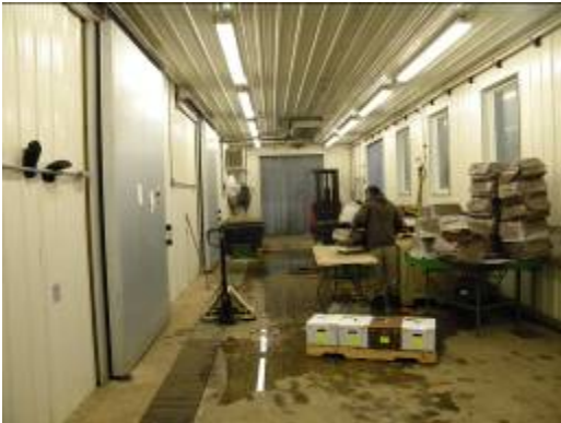
Featherstone's Packing Room