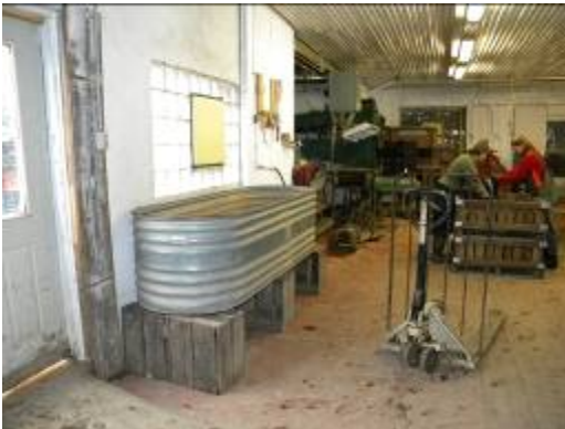
Galvanized stock tank on crates at Driftless Organics