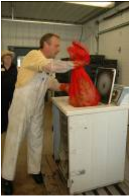
Washing machine for drying salad