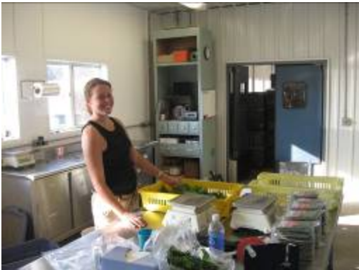
Packaging room at Rock Spring Farm