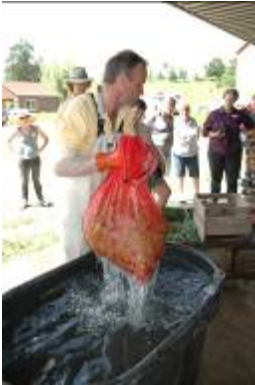
Mesh bags for initial rinsing