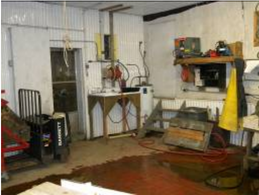
Handwash sink at Driftless Organics