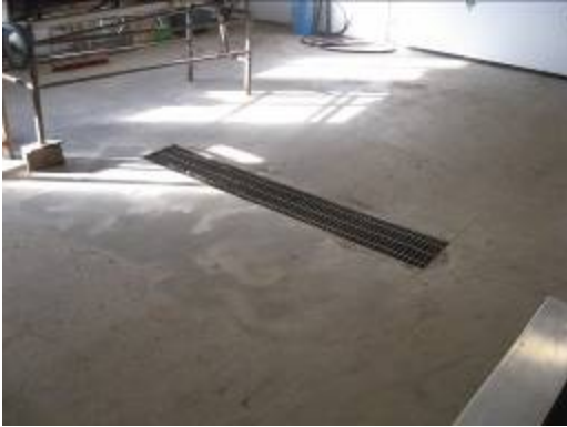
Trench drain at Rock Spring Farm