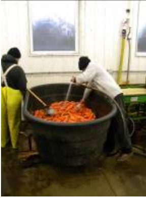
Washing carrots at Featherstone