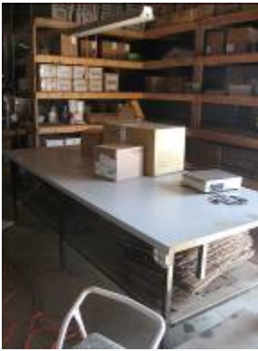
Sorting Table at Gardens of Eagan