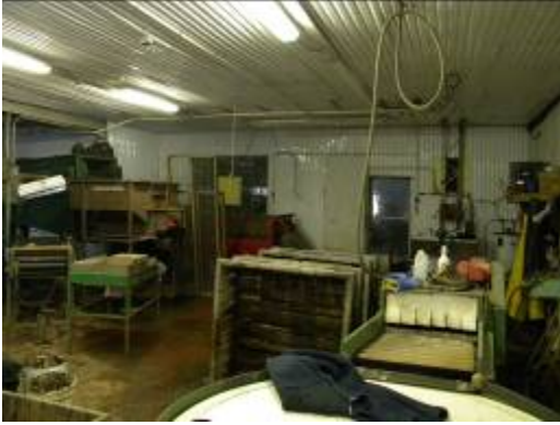
Overhead water pipes at Driftless Organics