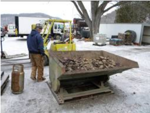
Material End Dump