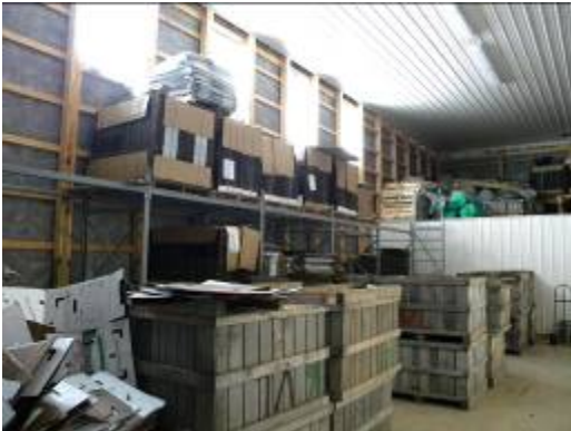
Dry storage at Featherstone